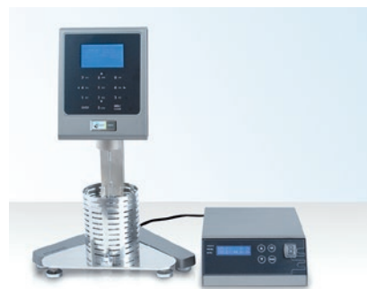
Temperature control unit 81-PV0118/T

Rotational Viscometer, high performance version, calibration certificate, USB, WIFI, Bluetooth, temperature sensor, datalogger software and power supply cable. Viscosity range 100-40 000 000cP, rotational speed 0.01-200rpm. 100-240V/50-60 Hz/1ph.