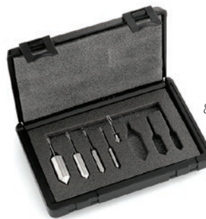
81-B0118/4 Spindle kit